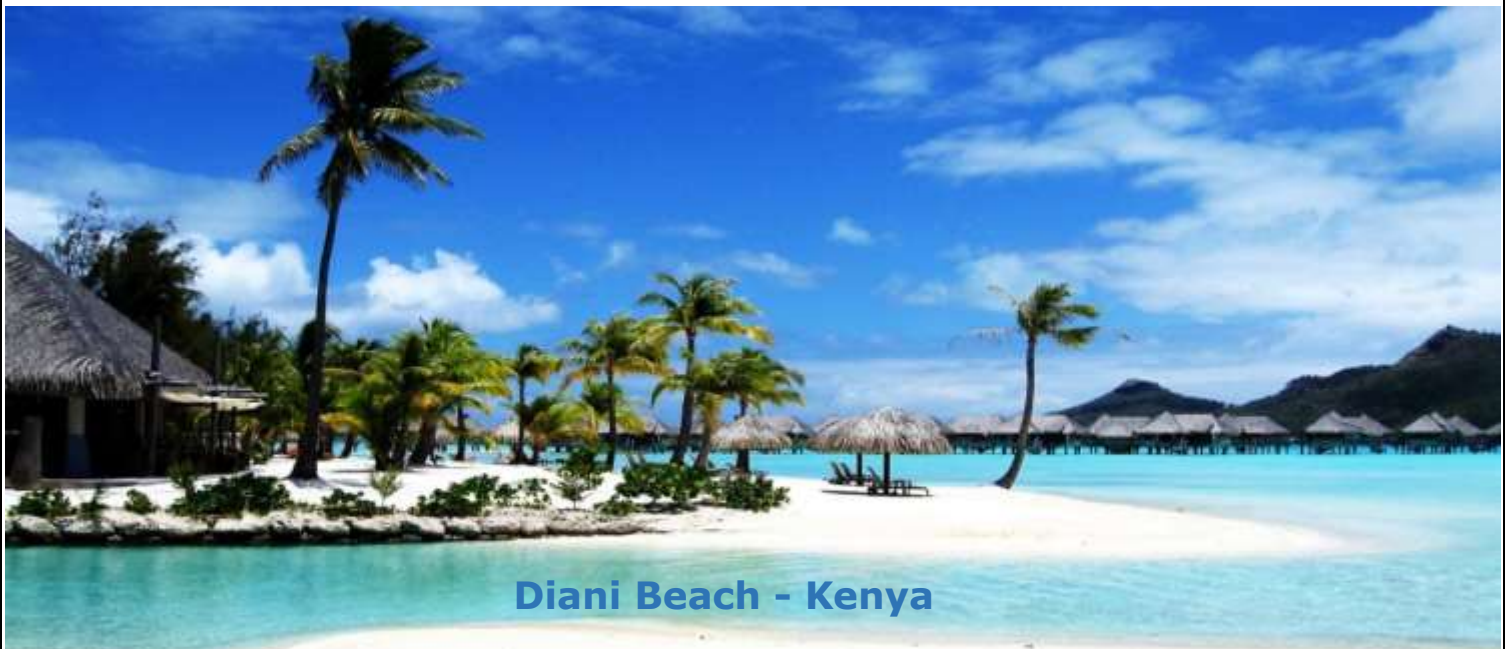
Diani Beach - Kenya