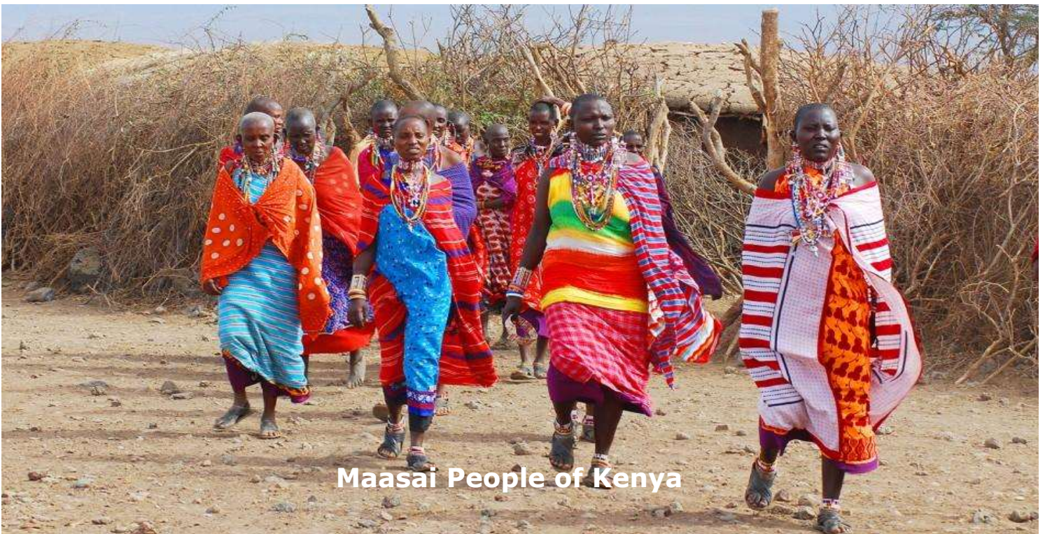
Maasai People of Kenya