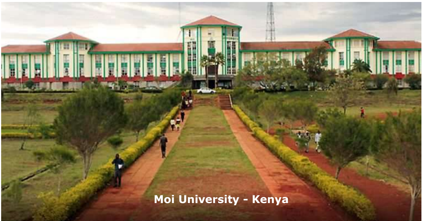
Moi University - Kenya